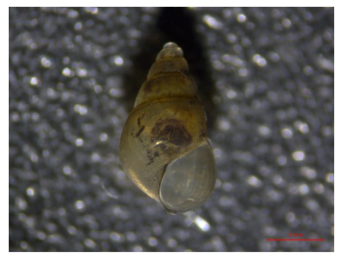
Figure 2. Helobia piscium shell with parts of animal body inside, found in a faecal sample from coscoroba swan.