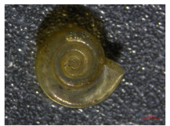
Figure 3. Drepanotrema sp. shell found in a faecal sample from coscoroba swan.

samples are analysed immediately after collection in the field are needed to assess whether these snails were indeed viable.