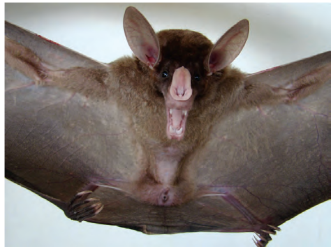
Figure 1. Vampyrum spectrum (Phyllostomidae) captured in the Nhumirim farm, Southern Pantanal, Mato Grosso do Sul, Brazil.

The records of V. spectrum reported in the upper Paraguay basin were obtained in forest habitats. Vieira (1955) collected one specimen in riparian forest, and Acosta & Azurduy (2006) collected two specimens at the border of a forest corridor associated to cultivated pasture areas. Our records were obtained in the typical Pantanal "cordilheiras", which are interconnected forest corridors and patches located in non-floodable terrain. These records, therefore, support that V. spectrum is able to